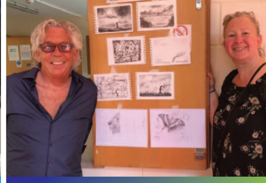
Residents get involved...