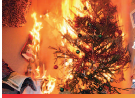
Fire safety at Christmas