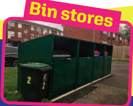
Bin stores have been improved across the district.