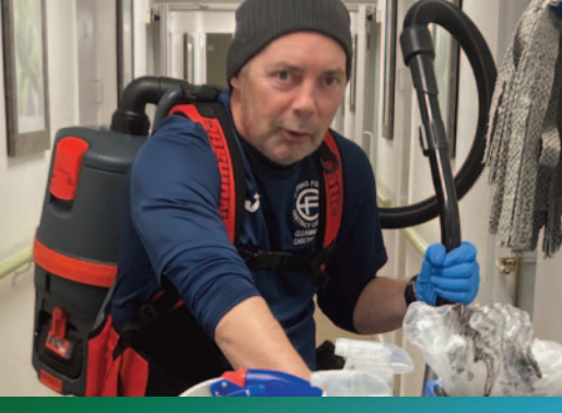
A day in the life of an EFDC Caretaker