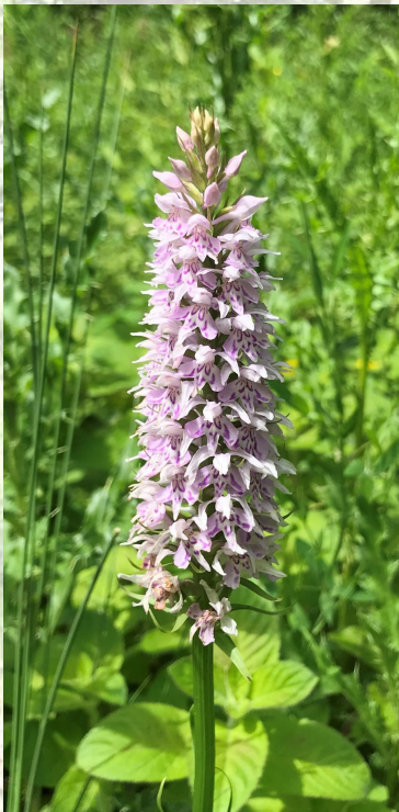
Common Spotted Orchid