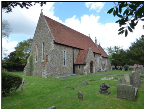
St Alban the Martyr

The Epping & Theydon Country Walk is a pleasant six mile walk through the parishes of Theydon Mount, Theydon Garnon and Epping and will take about 3 hours to complete.