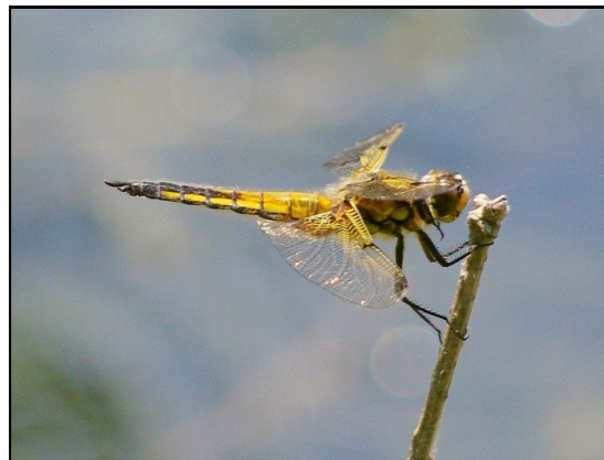
Four Spotted Chaser