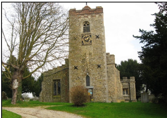
St Mary's Church

In recent times, transport systems have greatly affected the village and its surrounding countryside. The Stort Navigation tow-path forms much of the northern and eastern section of the walk, and although originally built for commercial reasons, use of the canal is now mainly for leisure. It also forms an excellent habitat for wildlife. On a warm summer's day, dragonflies can be seen hawking over the water, and if you are lucky you may even catch a glimpse of a Bank Vole or a Kingfisher.