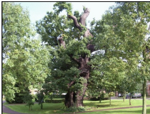
Veteran Pendunculate Oak (near no. 2 on the map.)

The Sheering Country Walk is an attractive 7 1/2 mile circular walk off the Stort Valley Way. It will take approximately 5 hours to complete. Alternatively you can split the walk into two shorter circuits; the northern circuit is 3 3/4 miles long and the southern one is 5 miles.