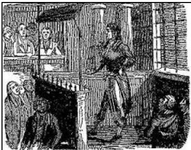
Sixteen String Jack.

This came from the 16 colourful strings he wore around the knees of his breaches. He was arrested for highway robbery six times before finally being convicted and hung in 1774 at the age of 24.