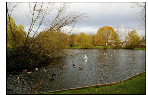
Theydon Bois Pond, on the green next to Poplar Row.