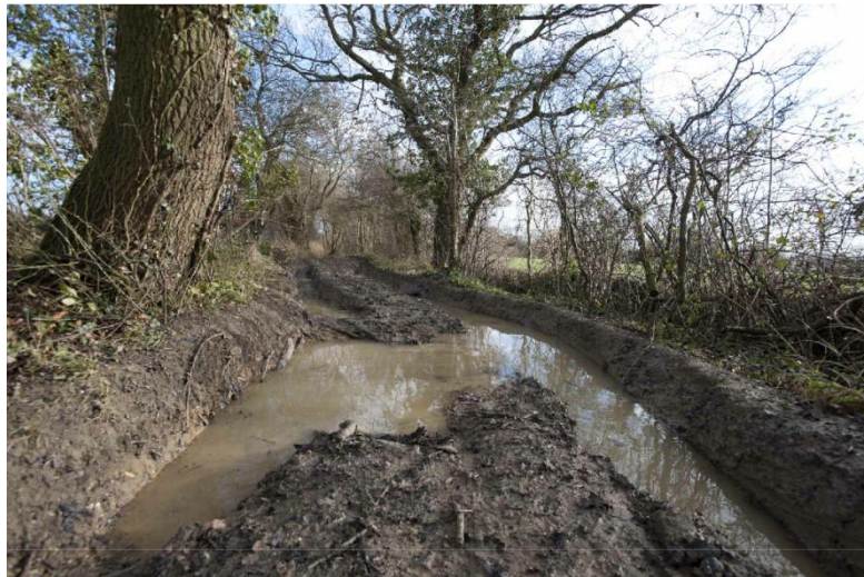
Photos of North Lane Moreton to show damage caused by four wheel drive vehicles