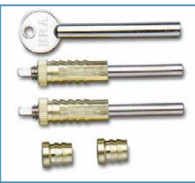
Dual Screw Bolt

For greater security they should be fitted in pairs. An alternative form of lock is the dual screw. These bolt the two sashes together. When used they also reduce draughts. The beading which holds the glass in place is frequently only pinned. The window can be made more secure by gluing in addition to pinning or screwing the beading, in place.