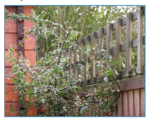
Trellis & Planting

A 1.8 meter fence all around the back garden will help keep the house secure. If the fence is topped with 30 to 45cms of opened or other similarly weak trellising, it will prevent most burglars from scaling it.