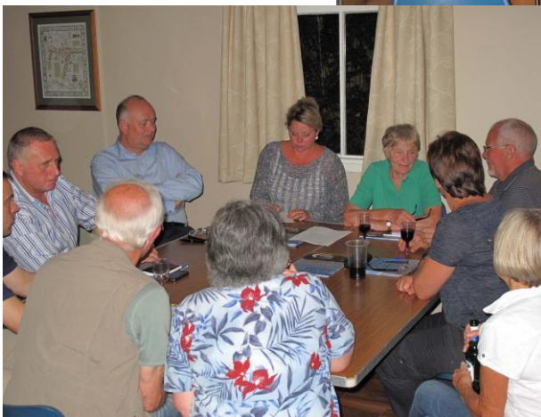
Planning the Knock Strategy