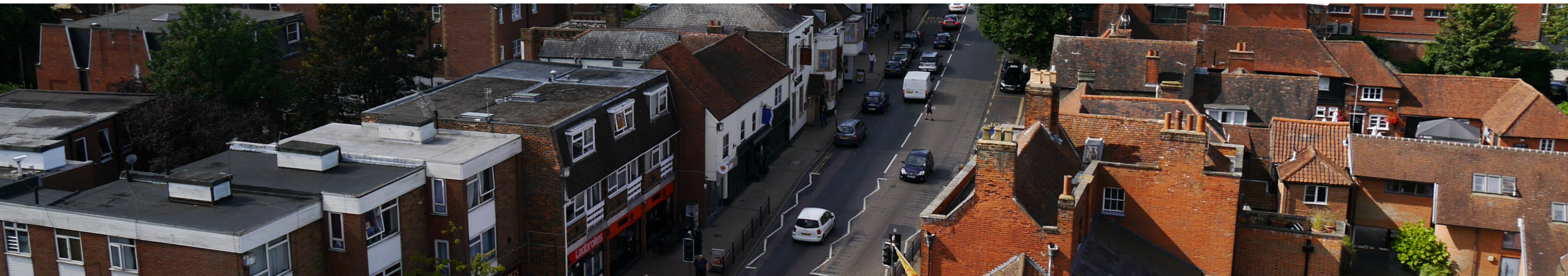
Epping town centre

Design Review: Principles and Practice Design Council CABE / Landscape Institute / RTPi / RIBA (2013)