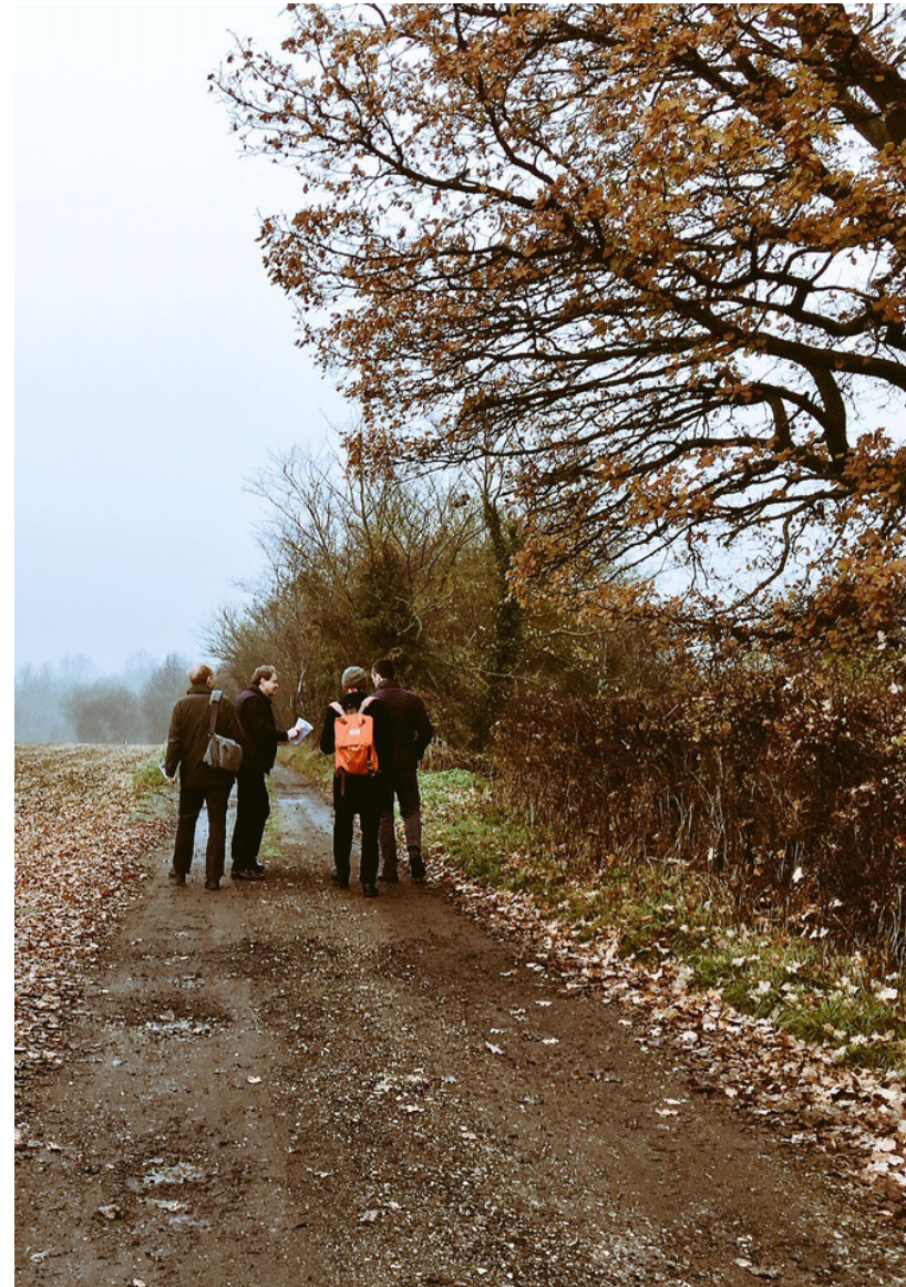
Panel site visit

At the end of each year, the Quality Review Panel manager will draft an annual report. This will be a brief document describing and reflecting on the panel's activities over the past year. As part of this annual review process, a meeting will be held with key Epping Forest District Council officers and the panel chair to discuss the report and consider any recommendations for the following year.