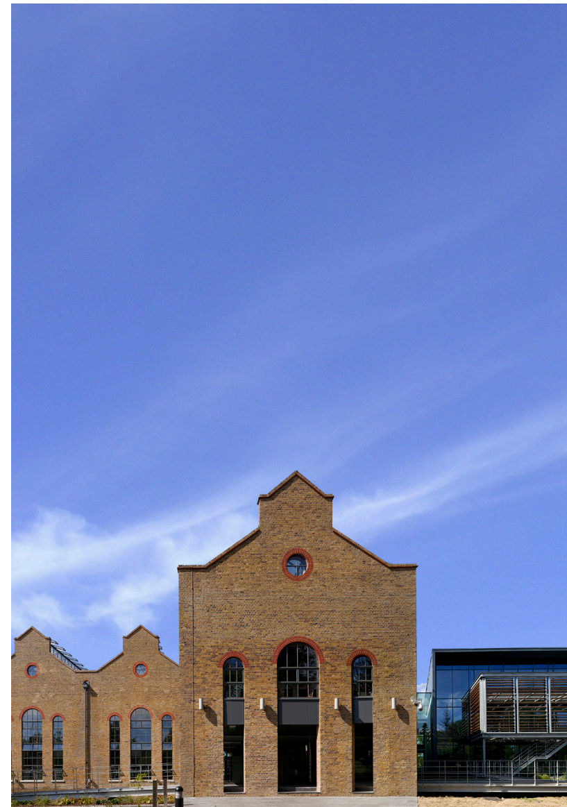
Gunpowder Mill, Waltham Abbey

In support of the District Council's commitment towards community engagement, there may also be potential, on occasion, to invite the chair of a community group to attend review meetings as an observer.