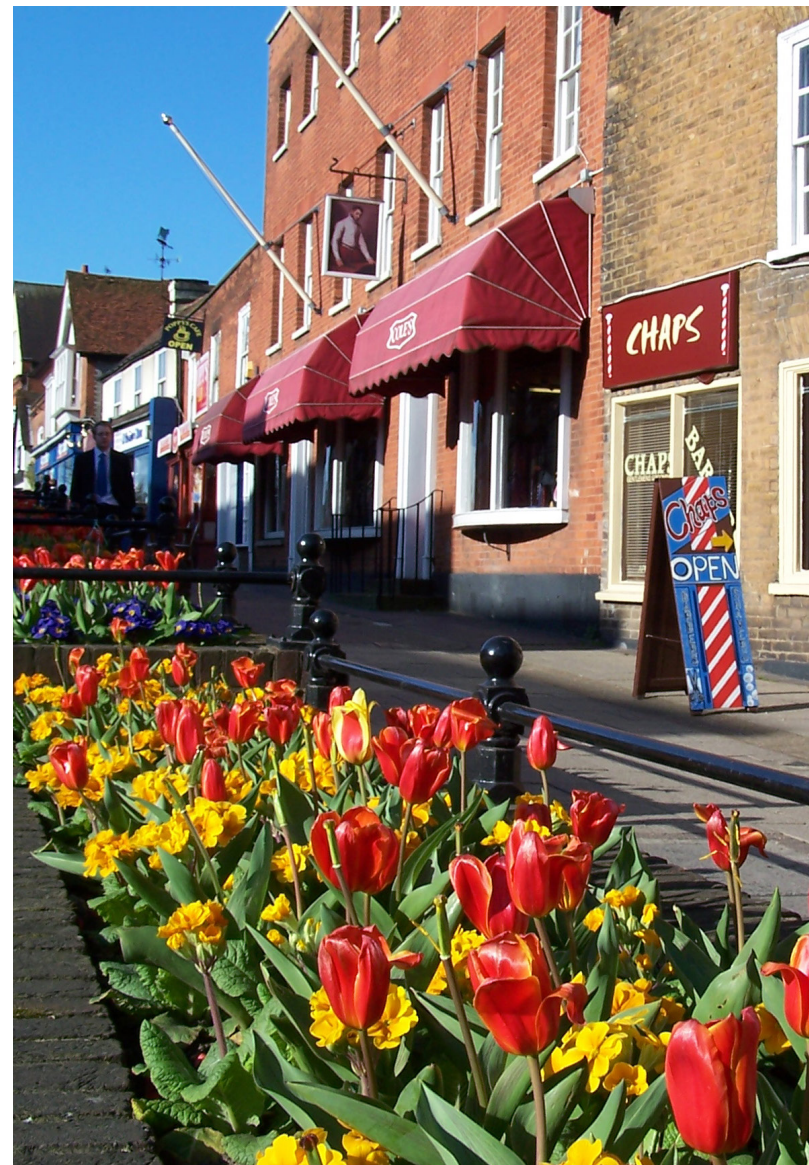
Epping High Street