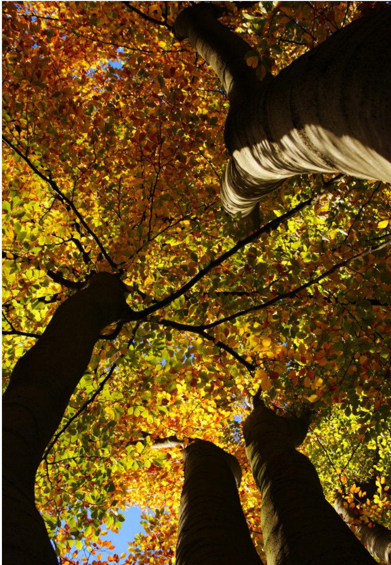
Beech trees in Epping Forest