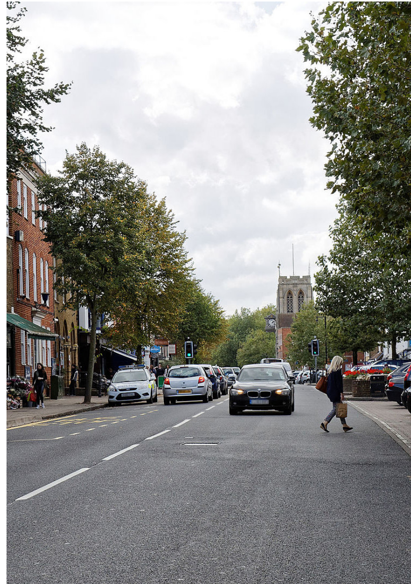
Epping town centre

The composition and remit of the panel reflects a review process that is multidisciplinary, collaborative and enabling.