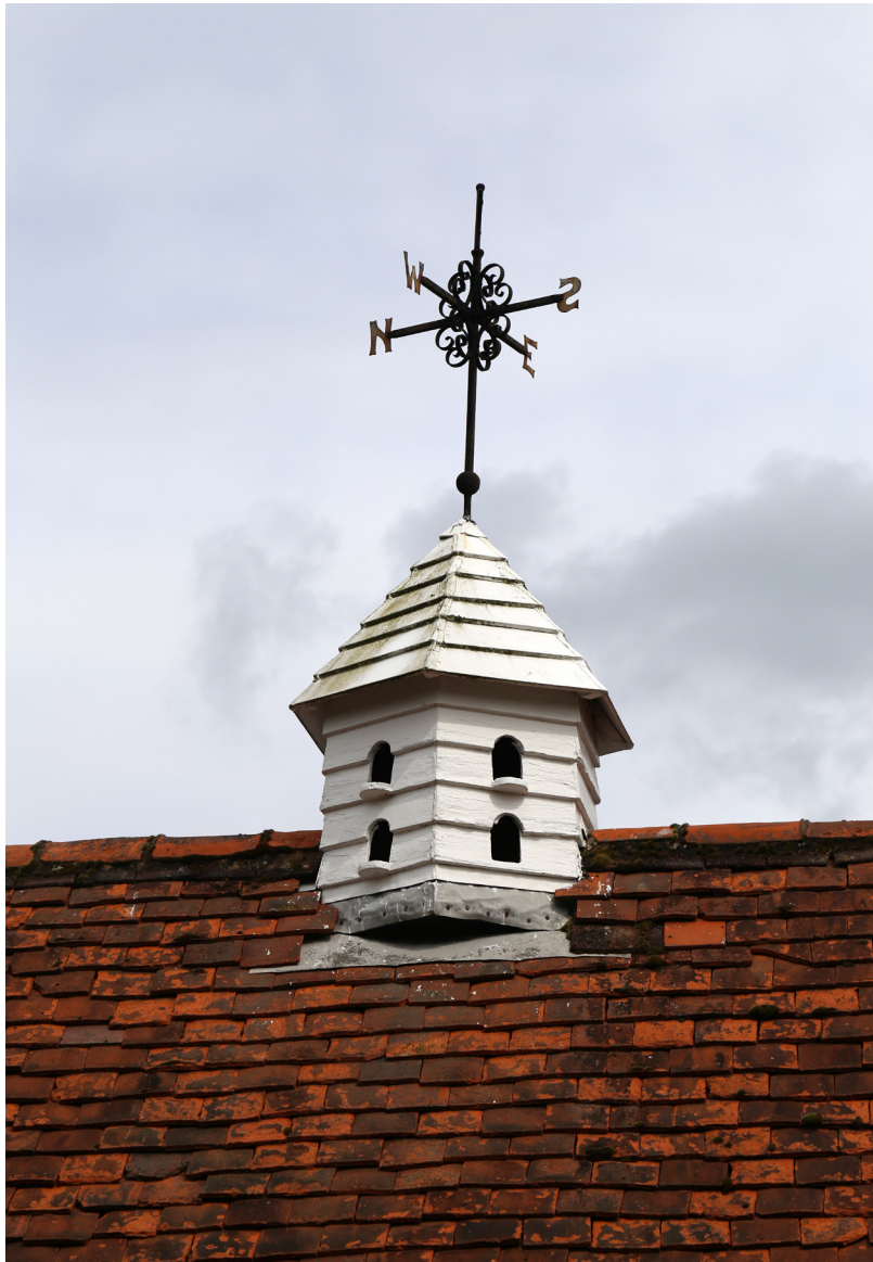
A pigeon cote on a cottage at Matching Tye, Essex