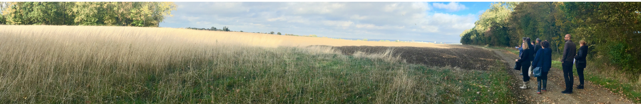
Panel site visit

Large projects, for example schemes with several development plots, may be split into smaller elements for the purposes of review to ensure that each component receives adequate time for discussion.