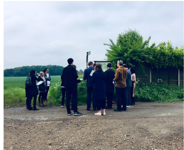
Panel site visit

As a public authority, the Epping Forest District Council is subject to the Freedom of Information Act 2000 (the Act). All requests made to the Council for information with regard to the Quality Review Panel will be handled according to the provisions of the Act. Legal advice may be required on a case by case basis to establish whether any exemptions apply under the Act.