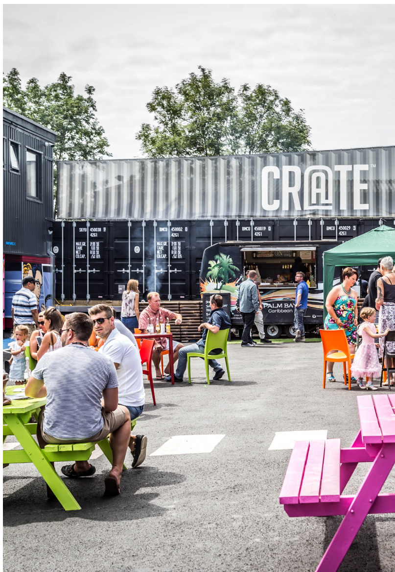
Crate Loughton