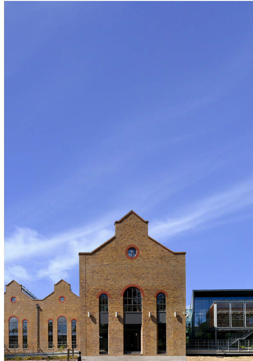
Gunpowder Mill, Waltham Abbey

In support of the District Council's commitment towards community engagement, there may also be potential, on occasion, to invite the chair of a community group to attend review meetings as an observer.