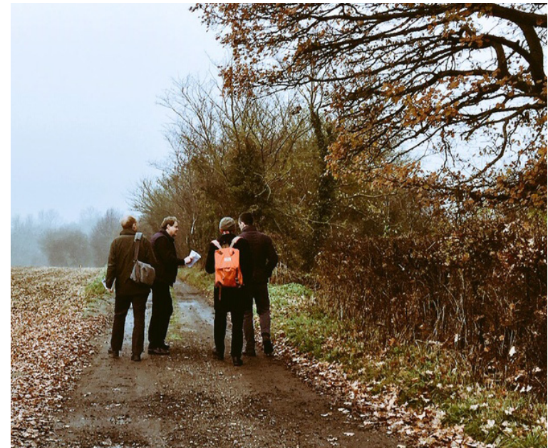
Panel site visit

As part of this annual review process, a meeting will be held with key Epping Forest District Council officers and the panel chair to discuss the report and consider any recommendations for the following year.