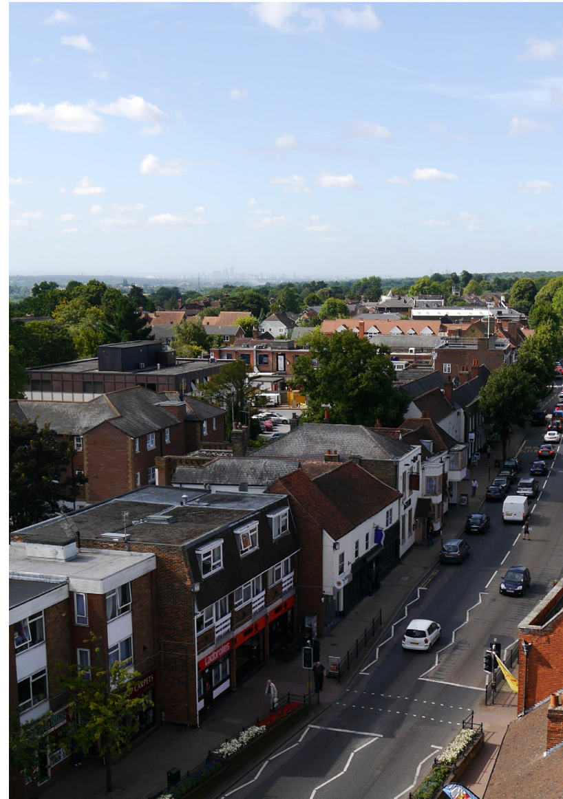
Epping town centre

The composition and remit of the panel reflects a review process that is multidisciplinary, collaborative and enabling.