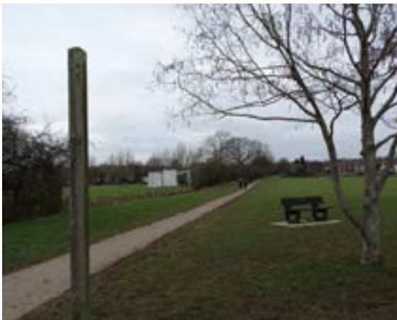
Signpost within the Recreation Ground