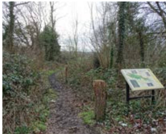
Entrance from Oakwood Hill