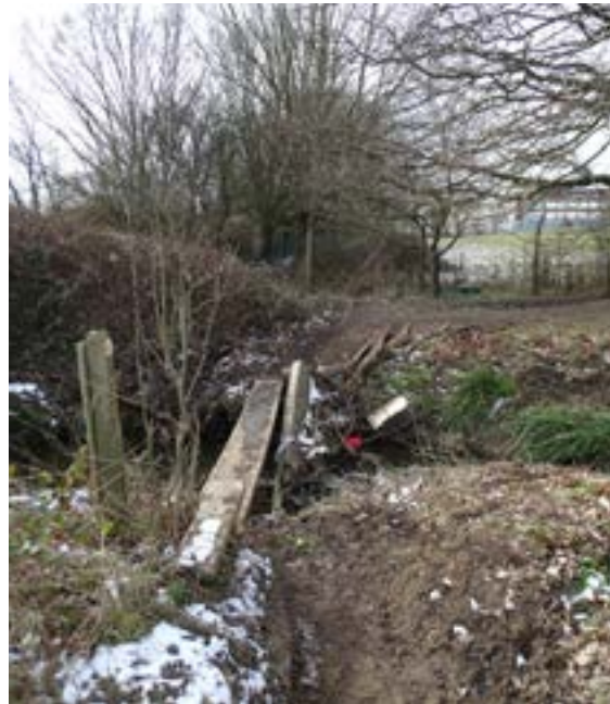
PRoW access from Debden