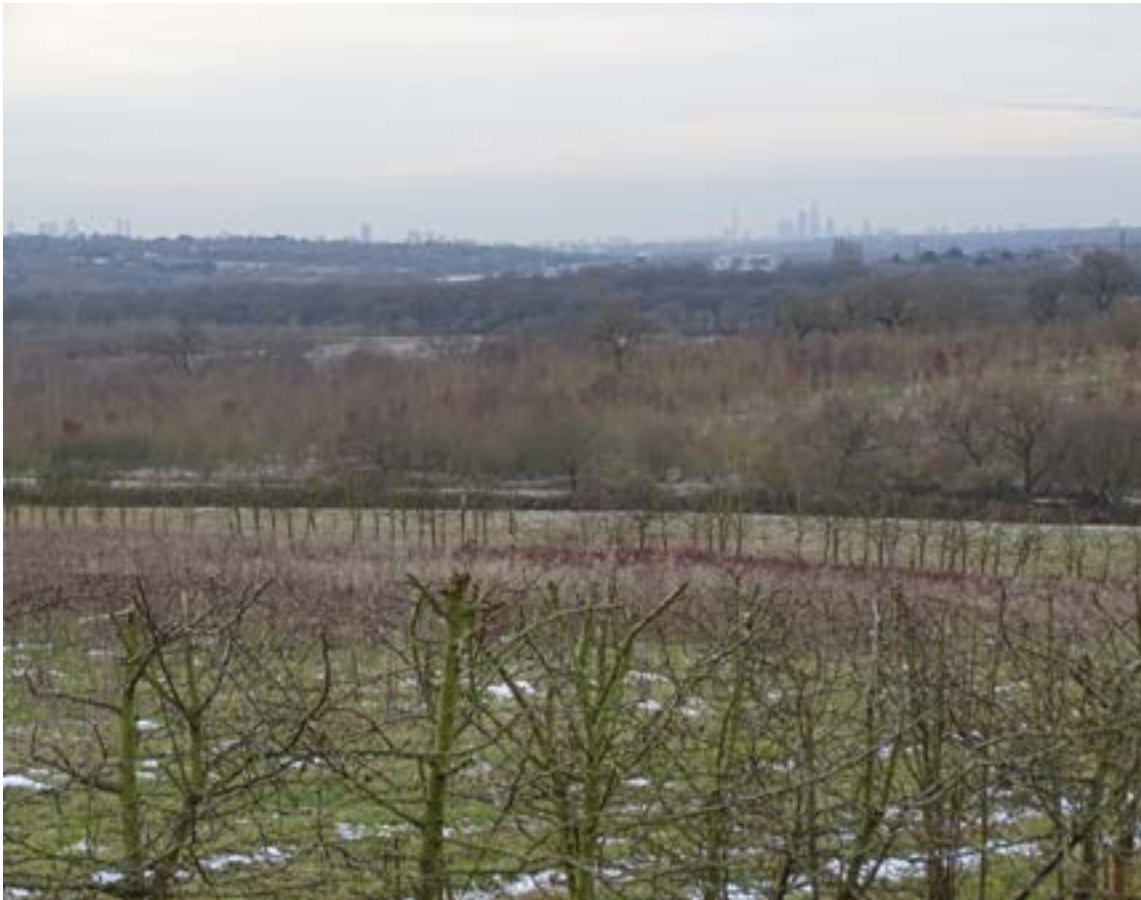
Views to Central London across the site

Information on visiting Theydon Bois Wood can be found here . The Management Plan 2017-2022 can be found here .