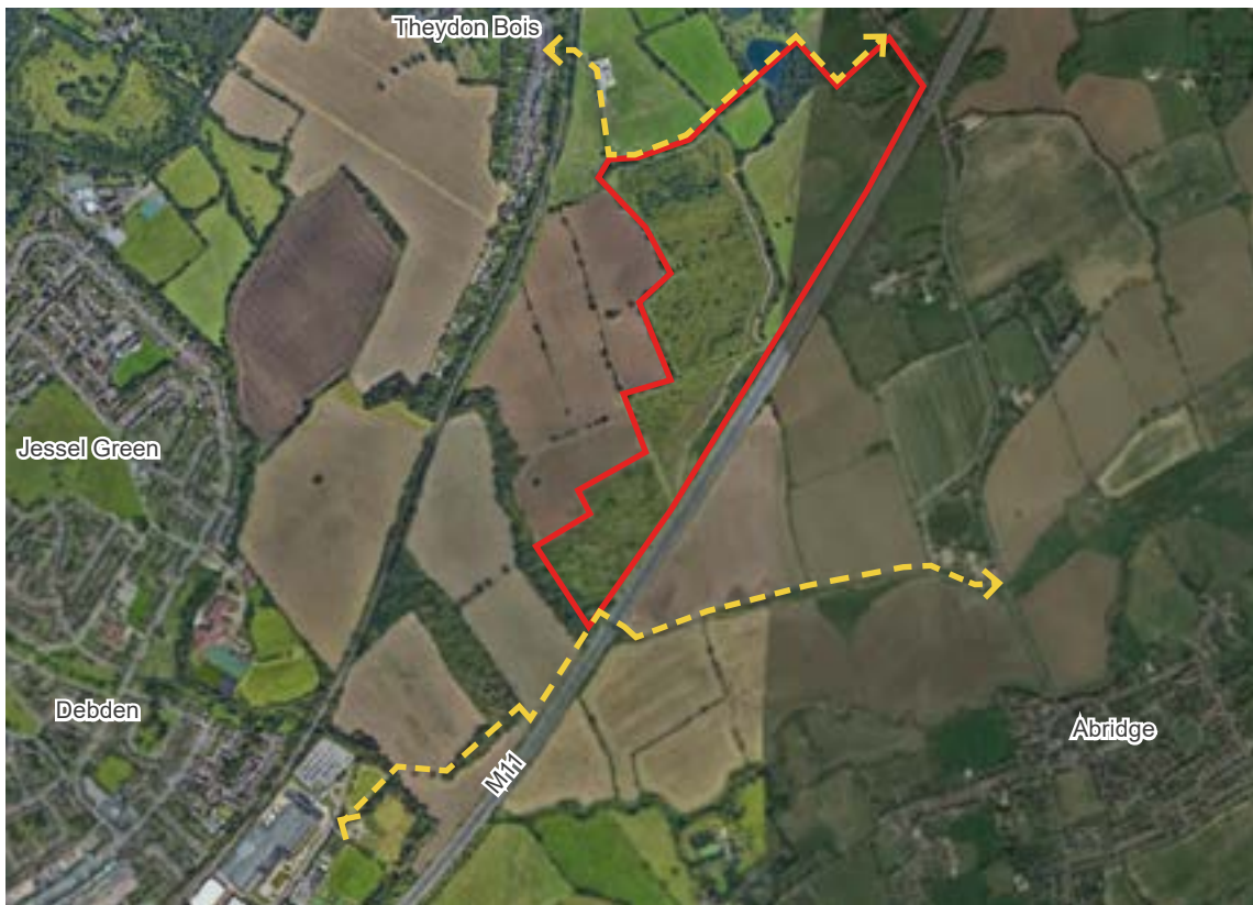
Aerial view of The Woodland Trust Site in Theydon Bois

The land is gently sloping grade III agricultural land immediately west of the M11 near Theydon Bois. It is close to Epping Forest and it is believed may have once formed part of it. A small stream cuts through the site. The entrance to the site is on the Abridge Road, heading out of Theydon Bois just before the M11 motorway flyover and parts of the site are very visible from it. Public Rights of Way outside of the site provide links into it from both Theydon Bois and Debden. There is a good network of paths through the wood, including two linked public rights of way and a surfaced path. Part of the site has been kept free from planting in order to retain important views from the site across London.