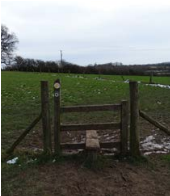
PRoW access from Theydon Bois

The site provides a unique resource for local residents. The development of the site has linked two previously disconnected parts of the ProW network. However, the links from both Theydon Bois and Debden are, for the main part, of a poor quality and wayfinding and signage is poor. In order to provide for access to it to support its use as a natural green space the PRoW network from both Theydon Bois and Debden into the site require enhancements in terms of surfacing, improving its accessibility for all and enhanced signage. Improvements of links within Debden itself to the site will also be explored.