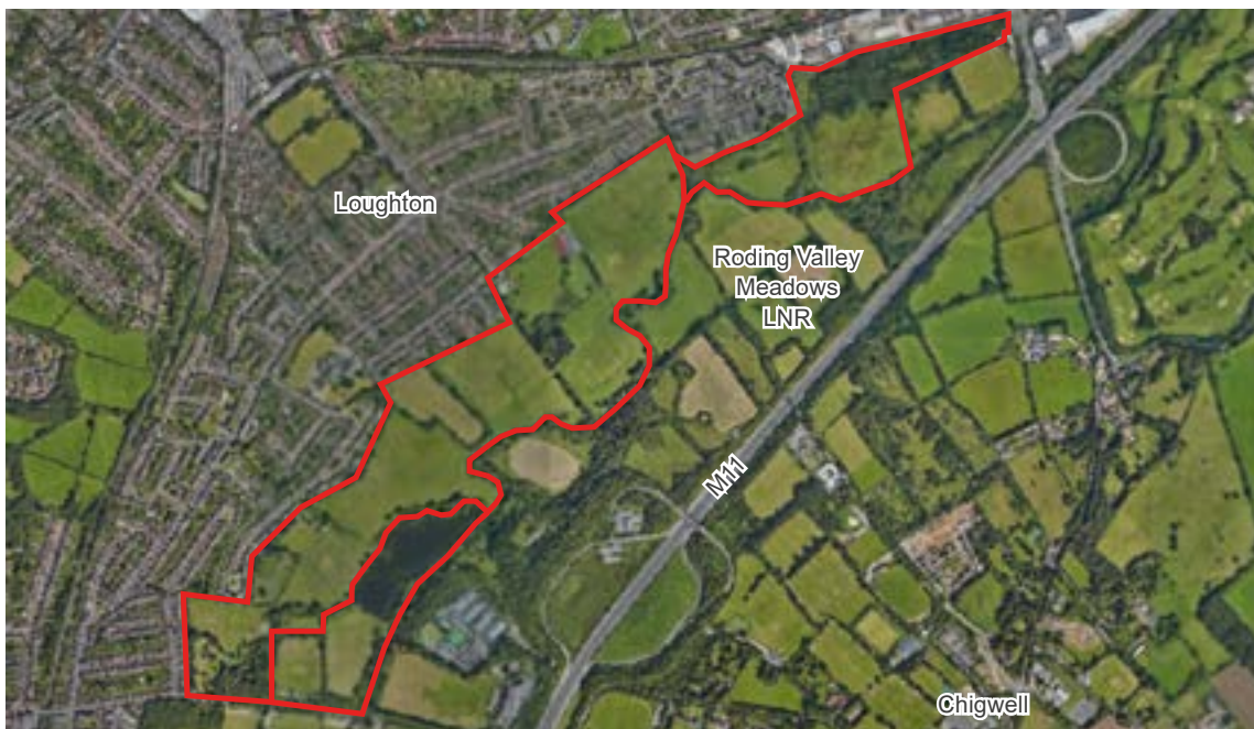
Aerial view of Roding Valley Playing Fields in Loughton

The eastern boundary of the site is defined by the River Roding with views across it to the Roding Valley Meadows in many places.