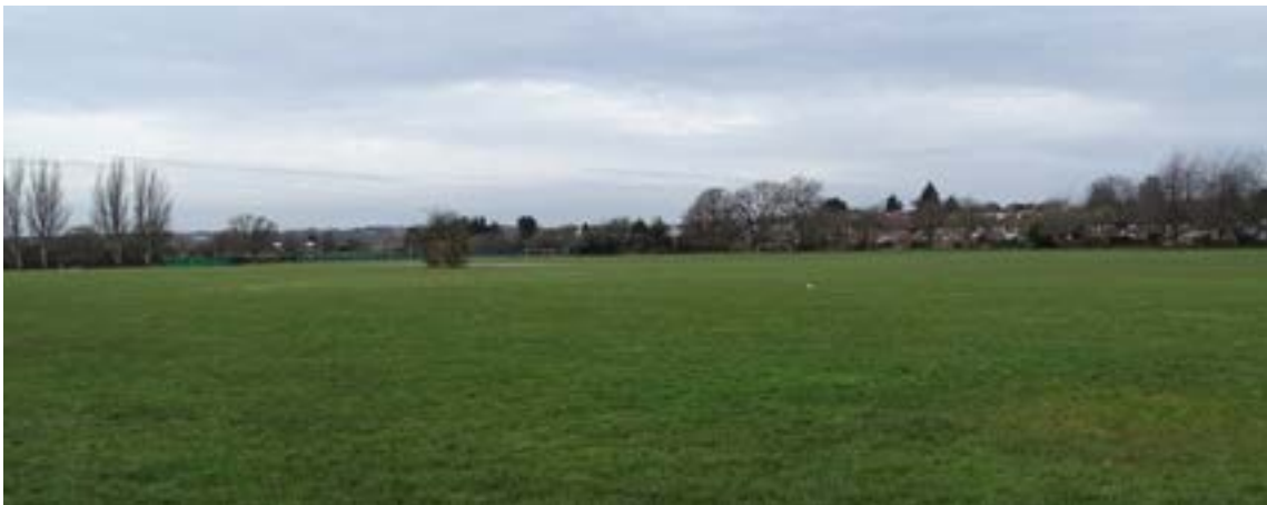
View over the Recreation Ground

Enhancements across the Recreation Ground part of the Project site would help to create more visual interest, increase biodiversity and enhance its usability. This could be achieved without impacting on the formal sports pitches and would enhance their context – building on the ‘Best Kept Pitches in Essex’ award made to Loughton Town Council in 2018.