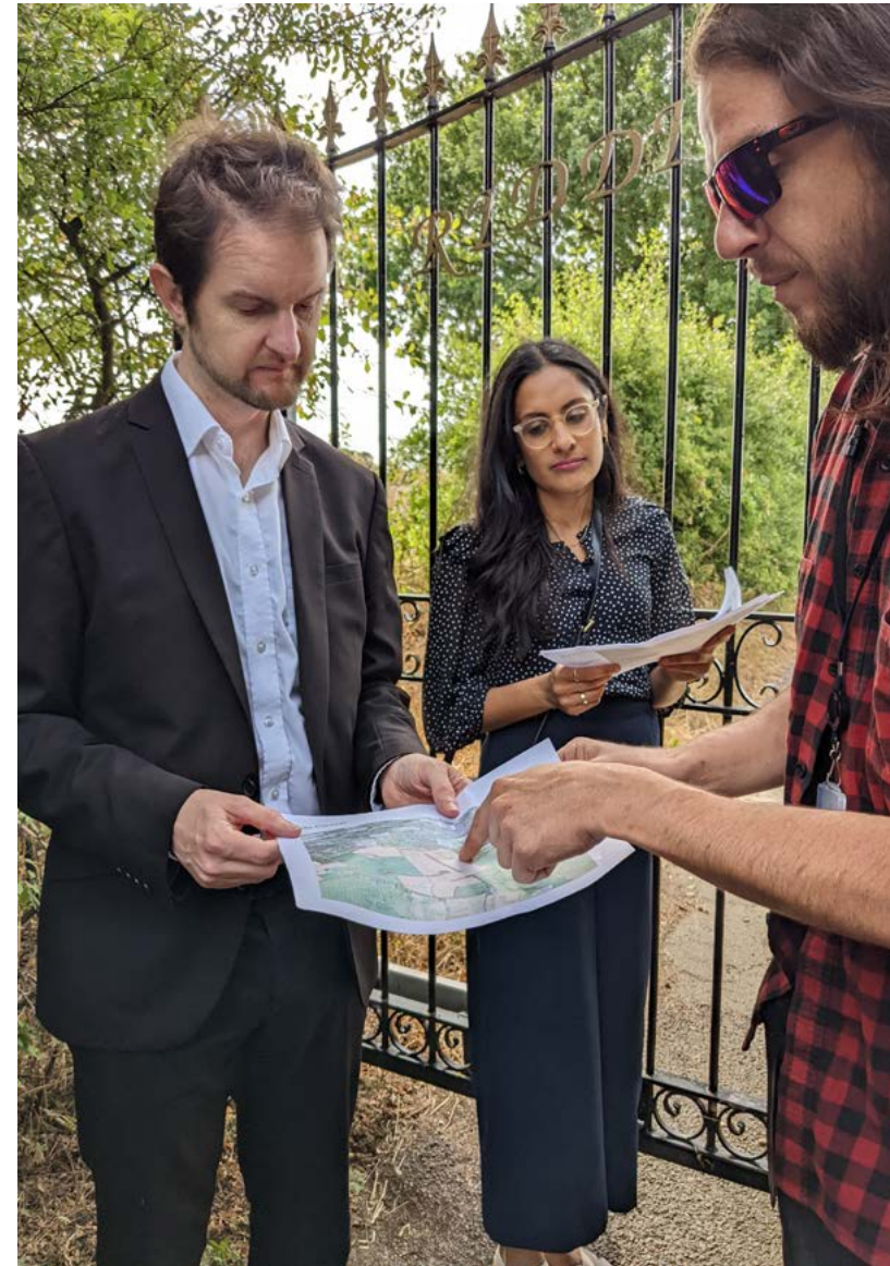
Site visit

In support of the District Council's commitment towards community engagement, there may also be potential, on occasion, to invite the chair of a community group to attend review meetings as an observer.