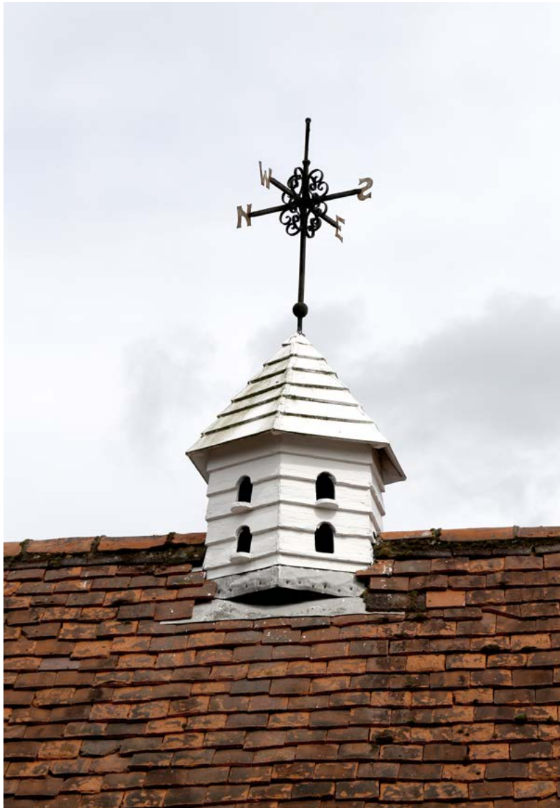
A pigeon cote on a cottage at Matching Tye, Essex