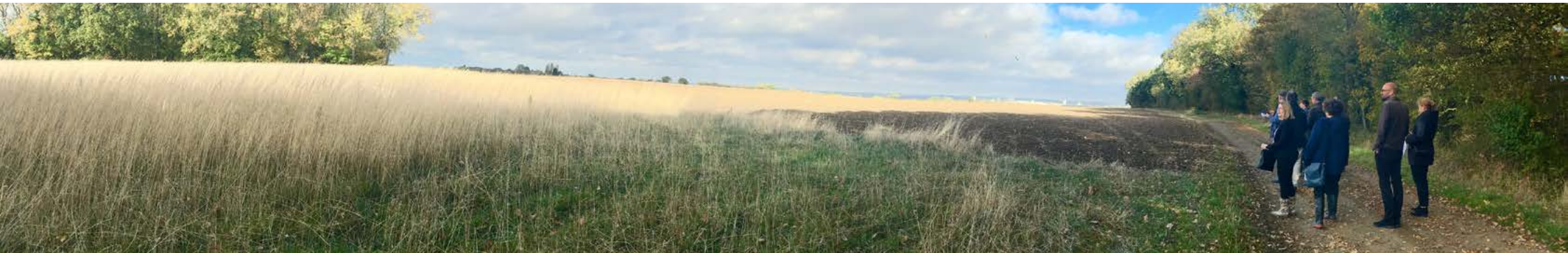
Panel site visit

Design Review: Principles and Practice Design Council CABE / Landscape Institute / RTPi / RIBA (2013)