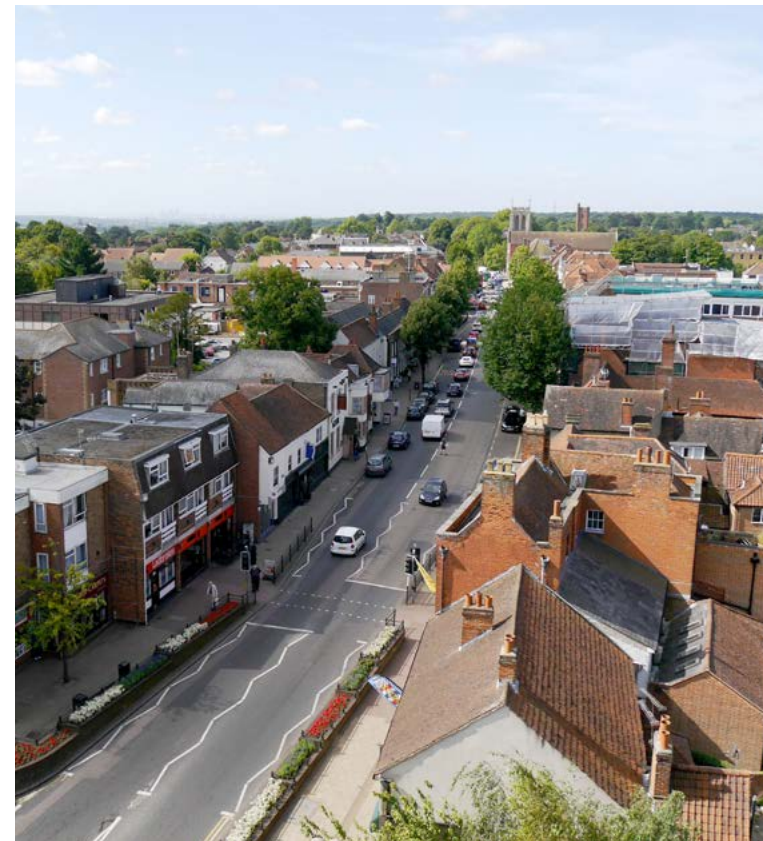
Epping town centre

The Quality Review Panel process will require a broad range of expertise. The panel brings together leading practitioners across those disciplines that have a particular relevance to the area. The composition and remit of the panel reflects a review process that is multidisciplinary, collaborative and enabling.