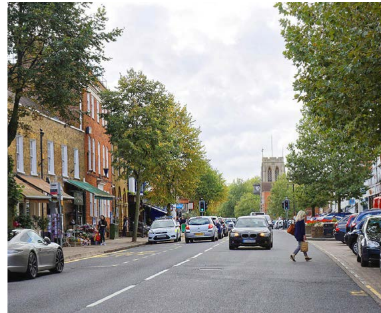
Epping High Street

As part of this annual review process, a meeting will be held with key Epping Forest District Council officers and the panel chair to discuss the report and consider any recommendations for the following year.