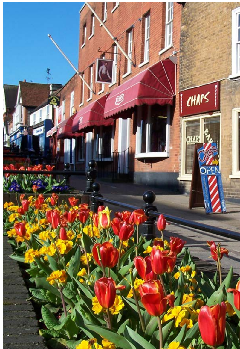
Epping High Street