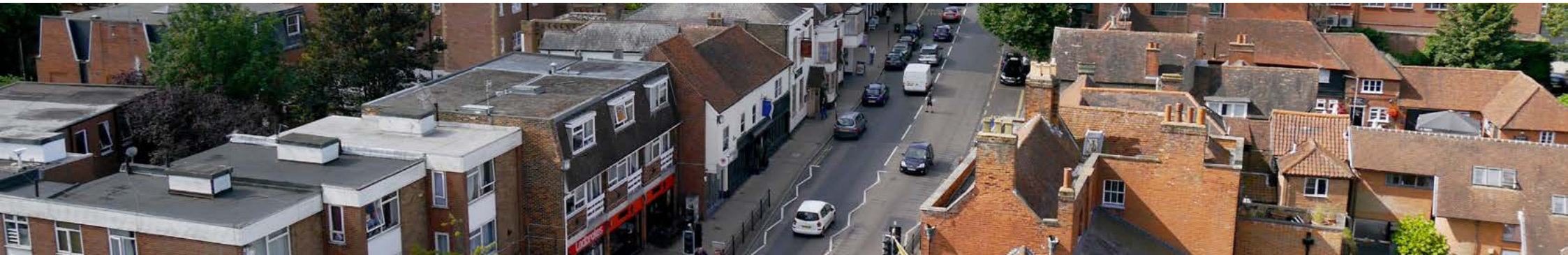
Epping town centre

Large projects, for example schemes with several development plots, may be split into smaller elements for the purposes of review to ensure that each component receives adequate time for discussion.