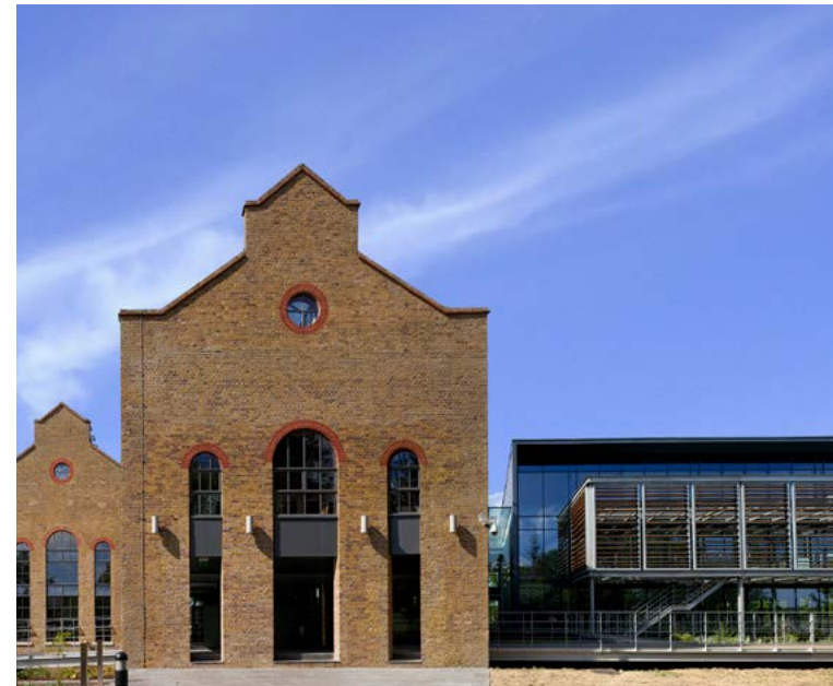
Gunpowder Mill, Waltham Abbey

As a public authority, the Epping Forest District Council is subject to the Freedom of Information Act 2000 (the Act). All requests made to the Council for information with regard to the Quality Review Panel will be handled according to the provisions of the Act. Legal advice may be required on a case by case basis to establish whether any exemptions apply under the Act.