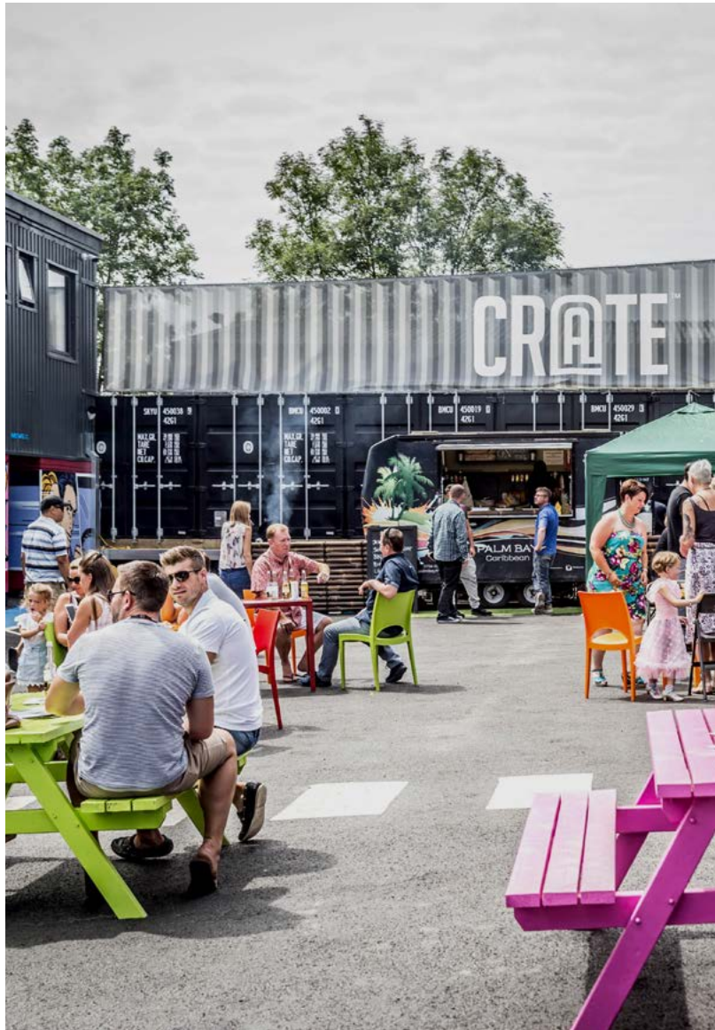
Crate Loughton © CRATE™